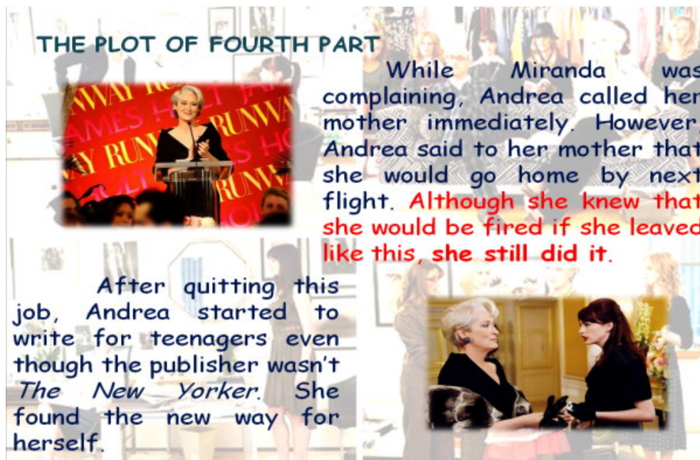
Figure 4: Group B revised version

Regarding the revised files, the cohesion in the choices of colour, template design, image, and font style became similarly slightly improved (items 3.2 and 3.3). The modified versions appeared to be better blended and more complementary from the point of view as shown in the following slide by Group B (Figures 2 & 4) as an example. A salient progression is the design of the knowledge representation across the set of slides. The color tones of both background and fonts belong to Mazarin blue. To make the slide content more readable and more pleasant, Group B adjusted the background to be brighter and the fonts to be darker and bigger to exhibit the contrast. The arrangements of the pictures and columns made the layout more dynamic. The peer discussion inspired students to adjust the design of their presentation, and the cohesion likewise improved.