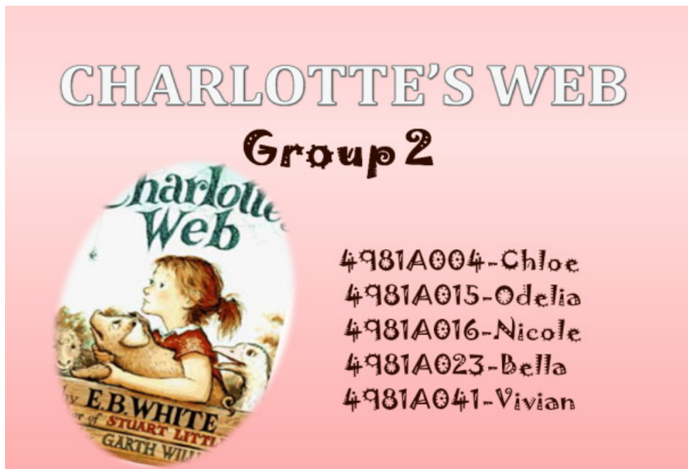
Figure 1: The title slide of Group A

An outstanding work by Group A (Figure 1) presented colours in an effective choice (white and pink) and font (Jokerman) for the names of the group and group members, but no group applied animation (Item 1.3) to increase the dynamic elements in a presentation. Some color tones of both background and word content showed no contrast so that the whole page might repel the audience as presented in Figure 2 (Item 1.7). A possible interpretation is that students designed the slides based on their own aesthetic standards; they might be unskillful at productions with the presentation software. Another possibility is that most groups probably focused on completing the task without considering the visual perceptions of the audience.