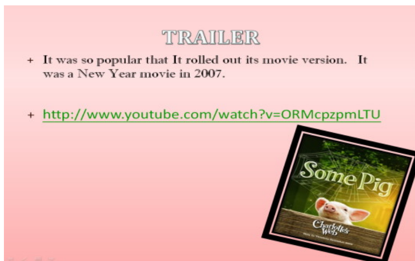
Figure 3: Trailer by Group A