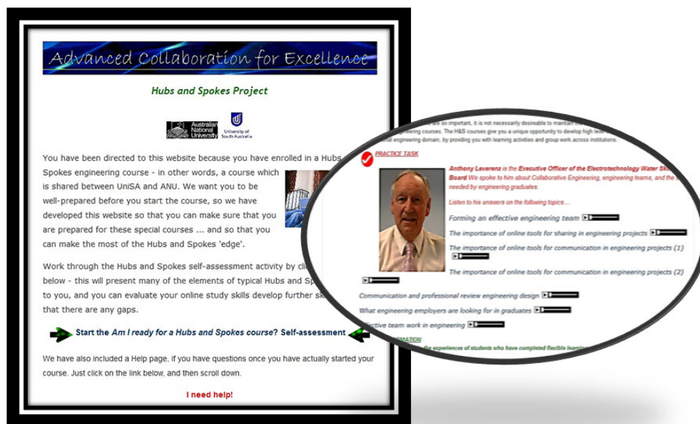
Figure 3: Screen picture from Hubs and Spokes Induction experience

competencies which our courses support. We also presented the collaboration between UniSA and ANU as an opportunity for the students to benefit from the complementary sharing of expertise between the two institutions.