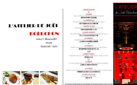
(b) Design a restaurant menu: an example of a student work: