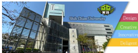
(a) Design a web banner: an example of a student work

In completing their assignments in the TT or OL class, students had to organise both the methods and skills that they had learned in the class; monitor their actions and progress; check outcomes and results; revise and refine the final work in order to meet the teacher’s requirements and reflect on all decisions made and actions taken during the class. Finally, after the completion of the experiment, all students were asked to complete an online questionnaire asking which teaching mode (TT or OL) they preferred and why (an open question).