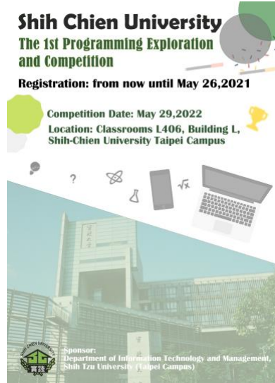
(c) Design an advertisement of a programming competition: an example of a student work: