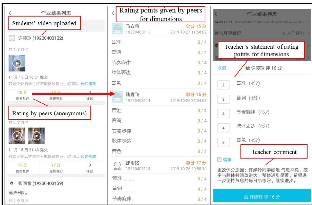
Figure 5. Interface for teacher assessment

For the interface of teacher assessment in Figure 5, teachers have access to the recorded videos of each student and the assessments by their peers. Teachers are able to view the rating score for each dimension in the rubrics and give comments.