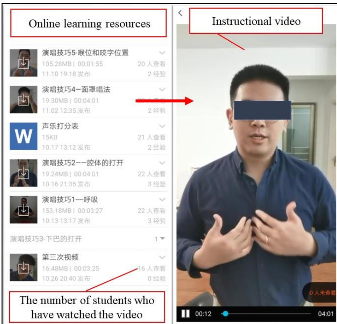
Figure 3. Interface of students' online mobile learning

Figure 3 illustrates the students' learning interface. The course information is designed for students to gain access to the teaching videos and practise and reflect at any time.