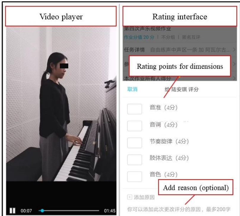
Figure 4: Interface for PA

As shown in Figure 4, during the assessment process, each student was randomly assigned the work of five peers by Mosoteach for rating and commenting on anonymously according to the rubrics, while also reflecting on the strengths and weaknesses of their own work.