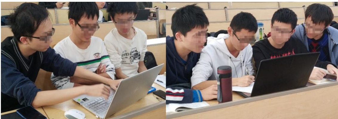
Figure 2. Students collaboratively reviewing notes and solving questions

As shown in Figure 2, in the second part, 45 minutes were spent on the students reviewing and practising what they had learned during the lecture. During this time, students were required to individually review their notes, answer the questions or solve the problems that the instructor put on the projector, through individual or group practice activities. In the meantime, the instructor could act as the facilitator providing quick feedback and responses to students' questions.