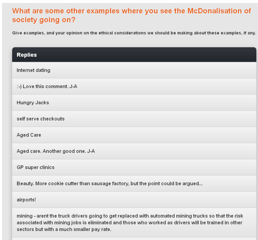
Figure 2. Examples of responses written by students on GoSoapBox