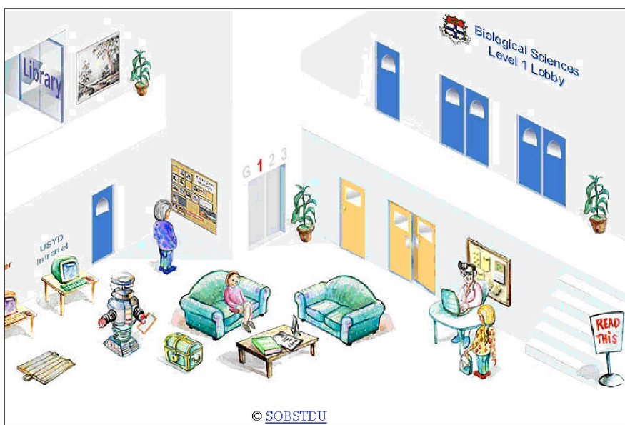
Figure 1: First Year Biology Lobby

The design of the VLE uses a building metaphor, the building representing the School of Biological Sciences. On completion of the VLE students will enter the foyer of the building and take the lift to any of Levels 1 to 3, representing the three years of undergraduate study. Currently our first year students log on directly to the VLE at the Level 1 Lobby (representing first year studies). Once in the First Year Lobby students are presented with access to general materials and help functions. Figure 1 shows the layout of the lobby [refer http://fybio.bio.usyd.edu.au/vle/L1/ ]. From the lobby the building metaphor is continued enabling students to enter various rooms, each of which represents a unit of study in first year biology, the Resource Centre (parts of the original online resources room) or other areas within the University, such as the University Library (Fisher Library catalogues).