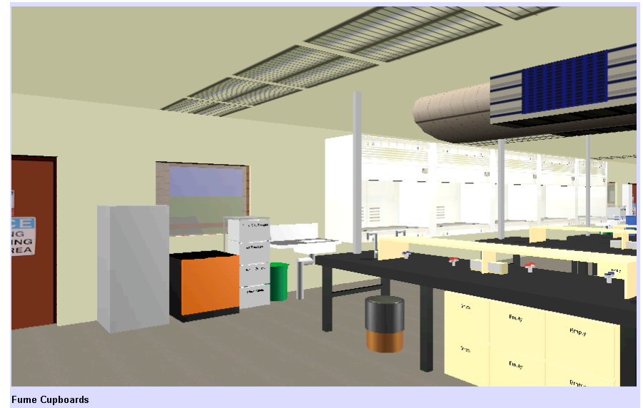
Figure 1. The Virtual Chemistry Laboratory used in Study 1 by the User Control Group. This shows a view after clicking on the fume cupboards

The study used a 3D environment based on the Charles Sturt University Wagga Wagga campus undergraduate chemistry laboratory. We refer to this environment as the virtual laboratory. Both the virtual laboratory and the environment used for training the participants were developed using the Virtual Reality Modelling Language (VRML) and were explored through Internet Explorer 5.5 and the Blaxxun Contact VRML browser version 5.104, using a PC with a 15 inch screen and a standard keyboard and mouse, running Windows 2000. The PCs had basic hardware acceleration, allowing a frame rate of between 5 and 15 frames per second (depending on the part of the virtual environment visible at the time). The virtual environments used the default VRML field of view of 45 degrees. The participants were allowed to choose their distance from the monitor, so the effective field of view was not controlled. Internet Explorer was configured to run full screen, so that none of the Internet Explorer options, or the Windows taskbar were visible.