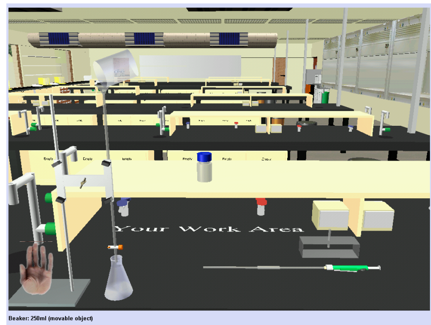
Figure 4. The Virtual Chemistry Laboratory used in Study 2 by the User Control Group. This shows a view after assembling the apparatus