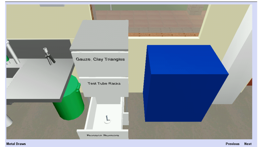
Figure 2. The Virtual Chemistry Laboratory used in Study 1 by the Dynamic Views Group. Notice the Next and Previous options.

Participants undertook a test on completion of the learning phase of the study. The test was delivered on paper but with supporting materials on computer (through a simple web site) to allow for the use of full colour images. Participants recorded their responses on paper and each part was completed and submitted before commencing the next part. Only the results of parts D and F of the test are discussed in this paper.