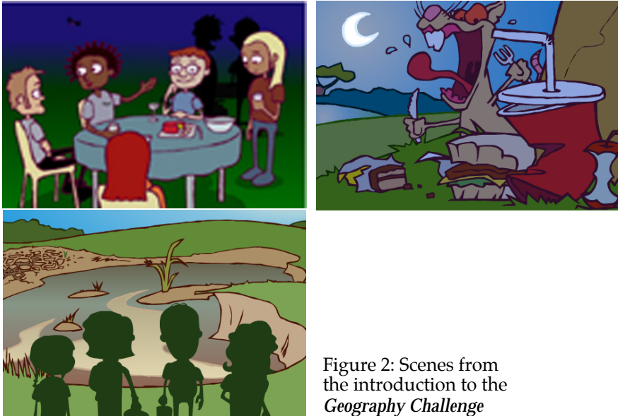
Figure 2: Scenes from the introduction to the Geography Challenge

Collins & Duguid, 1989; Herrington & Oliver, 2000). Essential elements of this approach to learning emphasise the enhancement of 'higher order' thinking skills through engagement with complex and ill-defined authentic tasks. The growth and application of knowledge to everyday problems requires the consideration of context in which the problem arises since a suitable response takes much of the meaning from the situation being confronted (Choi & Hannafin, 1995, p. 54).