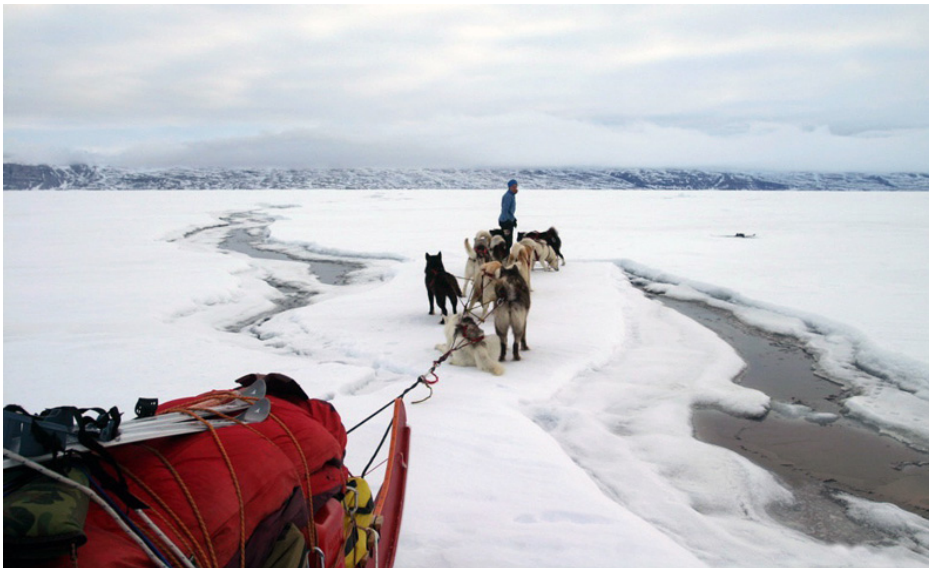
Figure 2: Team GoNorth! balances on a pan of ice to cross the lead and avoid falling in the Arctic Ocean