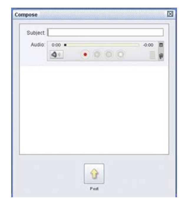
Figure 2. VB new message screen.

A VB was set up as a 'virtual staff room' to support the students. Students could use the VB to record a listening task (Figure 2), or they could upload a podcast they had created or obtained elsewhere (Figure 3).